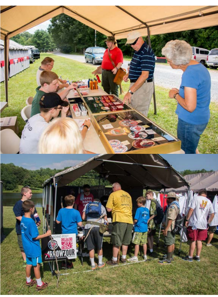
ArrowTour Staff from Southern Regino