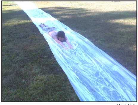
The Slip-n-Slide of Near Death was a hit.