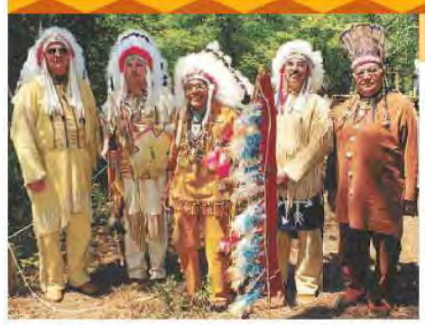
Members of the Nansemond tribe at First Landing State Park in 2007.

Cheroenhaka (Nottoway) Courtland/Southampton County Chickahominy Charles City County