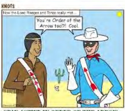
STAY ACTIVE IN ORDER OF THE ARROW -YOU NEVER KNOW WHO YOU MIGHT MEET!