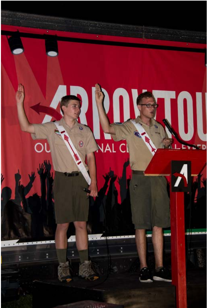
ArrowTour Staff from Southern Region