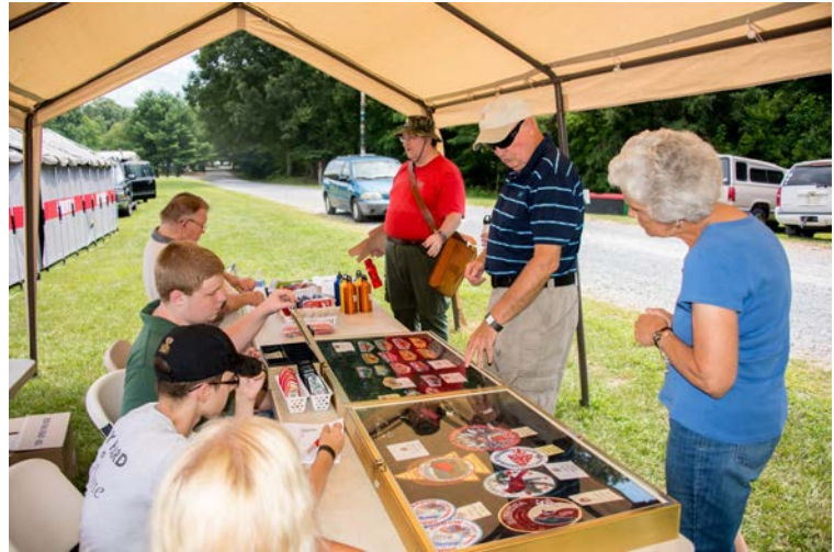
Arrowmen and Scouters enjoying some of the exhibits