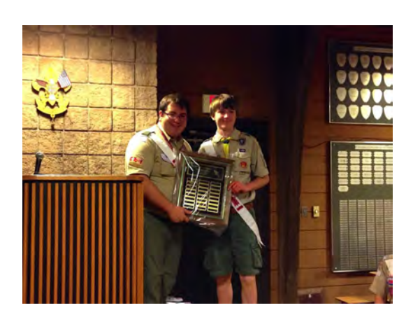
2014 Recipient of the Camp Promotions Award, Chapter 7.