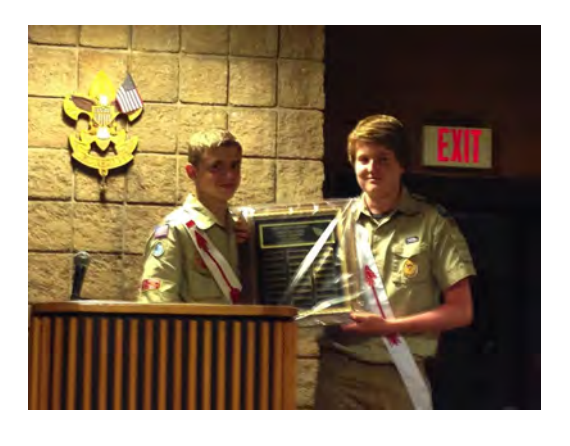
Chapter 4 receives the 2014 Unit Elections Award.