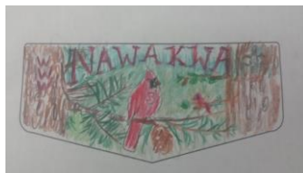
Idea to Final Product

We are always accepting artwork and idea submissions that can be turned into lodge items like function patches and lodge flaps. This year is NOAC 2018 and next year Nawakwa is hosting Conclave during its 100th Anniversary! We need your ideas! Your idea or design could become an official product of Nawakwa Lodge!